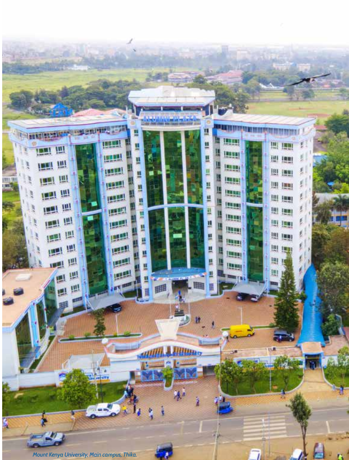
Mount Kenya University, Main campus, Thika.