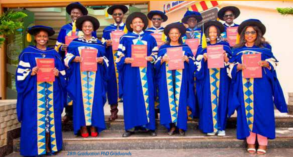
28th Graduation PhD Graduands