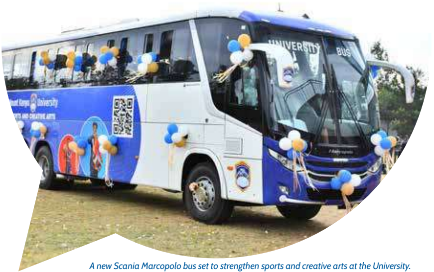
A new Scania Marcopolo bus set to strengthen sports and creative arts at the University.