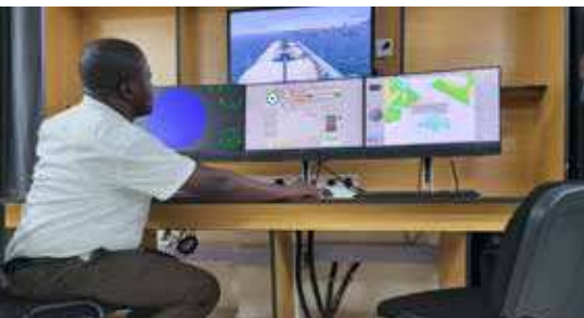
Mount Kenya University Maritime Academy