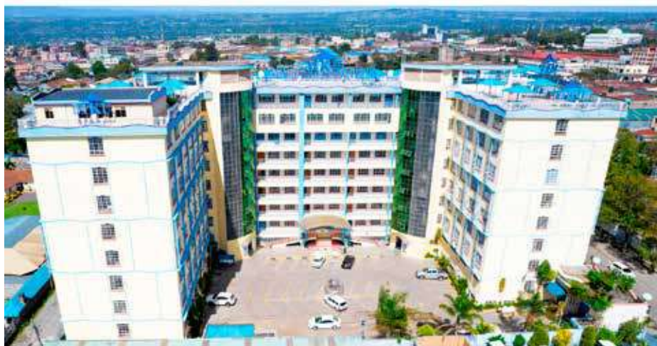
Nakuru Campus – A centre of excellence in Agriculture and Science training