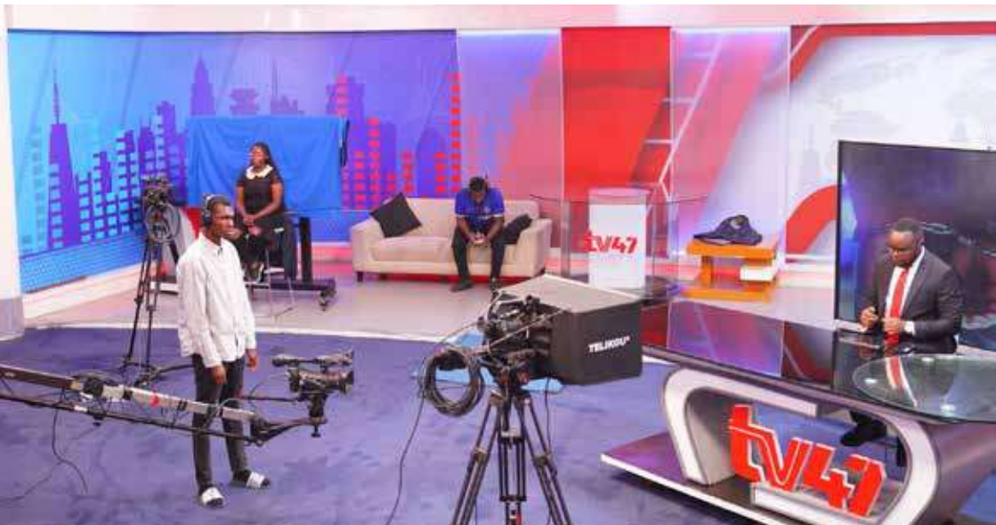
Practical training at Cape media( TV47 and Radio 47)